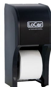
Matte Black | D67013-N