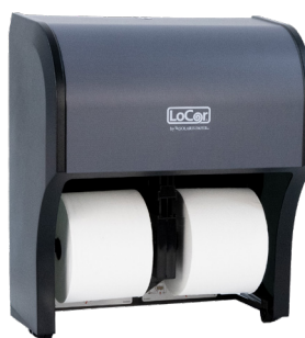
Matte Gray | D67052N