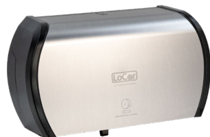
Stainless | D67021-N