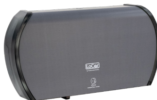
Matte Gray | D67042-N