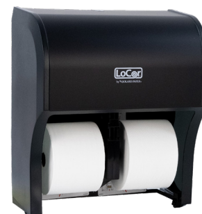
Matte Black | D67053-N

For maximum efficiency, our high-capacity LoCor® bath tissue fits both side-by-side and top-down dispenser models, and is available in 1000, 1500 and 3000 sheet rolls.