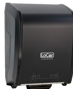
Matte Black | D68006-N