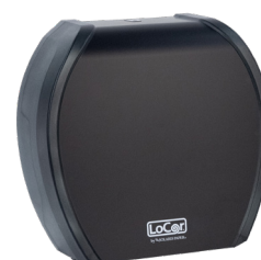
Matte Black | D67033-N

LoCor® Jumbo Bath Tissue works with both Jumbo Bath Tissue dispensers to provide 1200 feet of continuous paper, right down to the core.