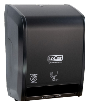
Matte Black | D68003-N