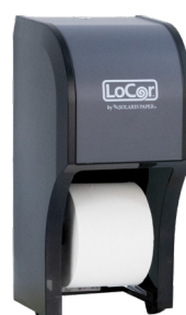
Matte Gray | D67012-N