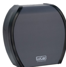
Matte Gray | D67032-N