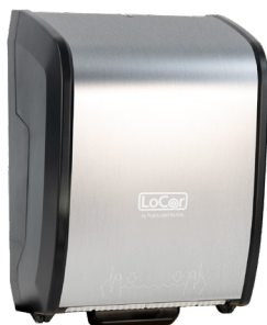
Stainless | D68004-N