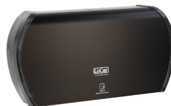
Matte Black | D67043-N