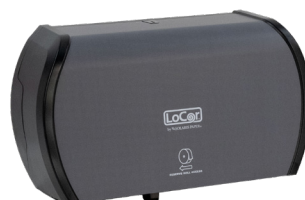
Matte Gray | D67022-N