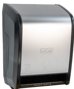
Stainless | D68001-N

Butler Mode Available Stainless | D68061-N Matte Black | D68063-N