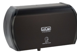
Matte Black | D67023-N