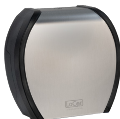
Stainless | D67031-N