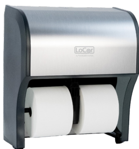
Stainless | D67051N