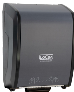
Matte Gray | D68005-N