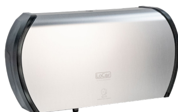
Stainless | D67041-N