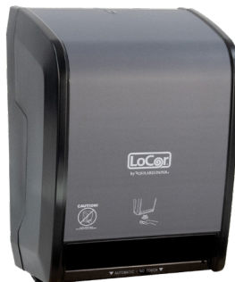
Matte Gray | D68002-N