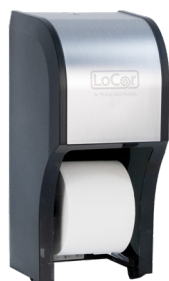
Stainless | D67011-N