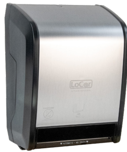
Stainless | D68001-N

Butler Mode Available Stainless | D68061-N Matte Black | D68063-N