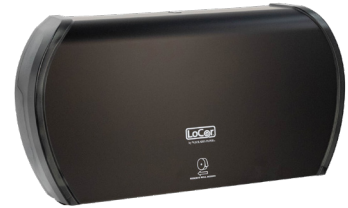
Matte Black | D67043-N