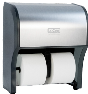
Stainless | D67051N