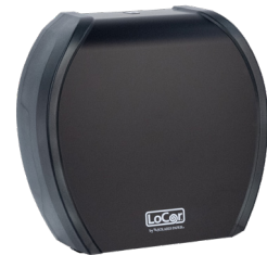
Matte Black | D67033-N

LoCor® Jumbo Bath Tissue works with both Jumbo Bath Tissue dispensers to provide 1200 feet of continuous paper, right down to the core.