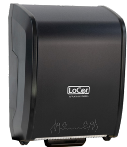
Matte Black | D68006-N