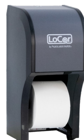
Matte Gray | D67012-N