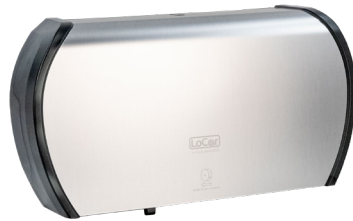
Stainless | D67041-N