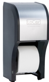
Stainless | D67011-N