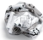
LoCor® Tissue vs Universal Bath Tissue (80 Roll / 500 Sheet Count)