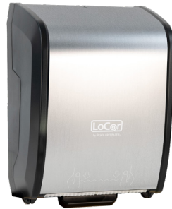
Stainless | D68004-N