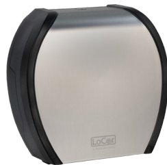
Stainless | D67031-N