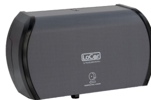
Matte Gray | D67022-N