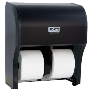
Matte Black | D67053-N

For maximum efficiency, our high-capacity LoCor® bath tissue fits both side-by-side and top-down dispenser models, and is available in 1000 and 1500 sheet rolls.