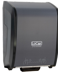
Matte Gray | D68005-N