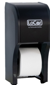
Matte Black | D67013-N