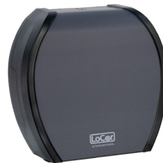
Matte Gray | D67032-N