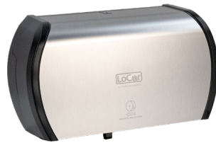
Stainless | D67021-N