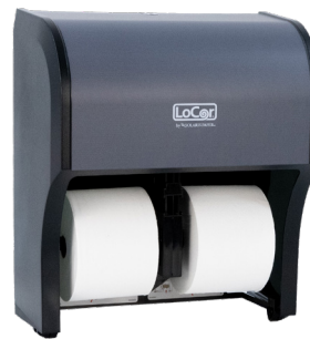
Matte Gray | D67052N