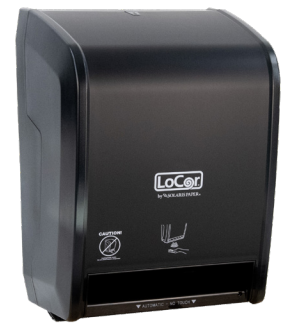
Matte Black | D68003-N