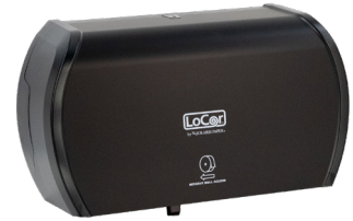
Matte Black | D67023-N