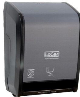
Matte Gray | D68002-N