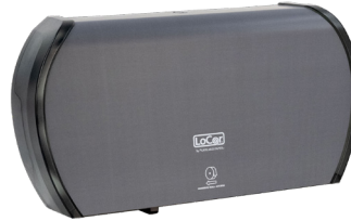
Matte Gray | D67042-N